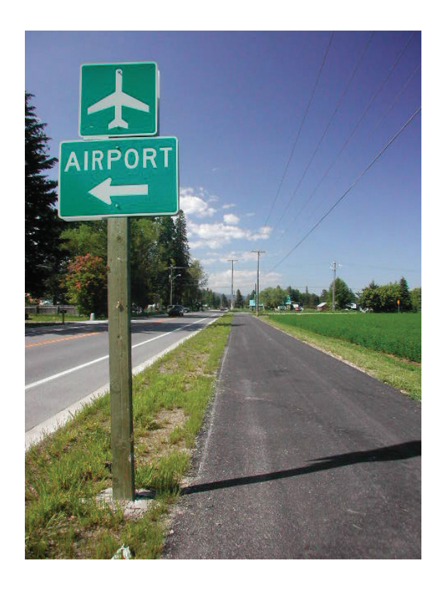
and balanced for both safety and service improvements. (CPP 3.10)